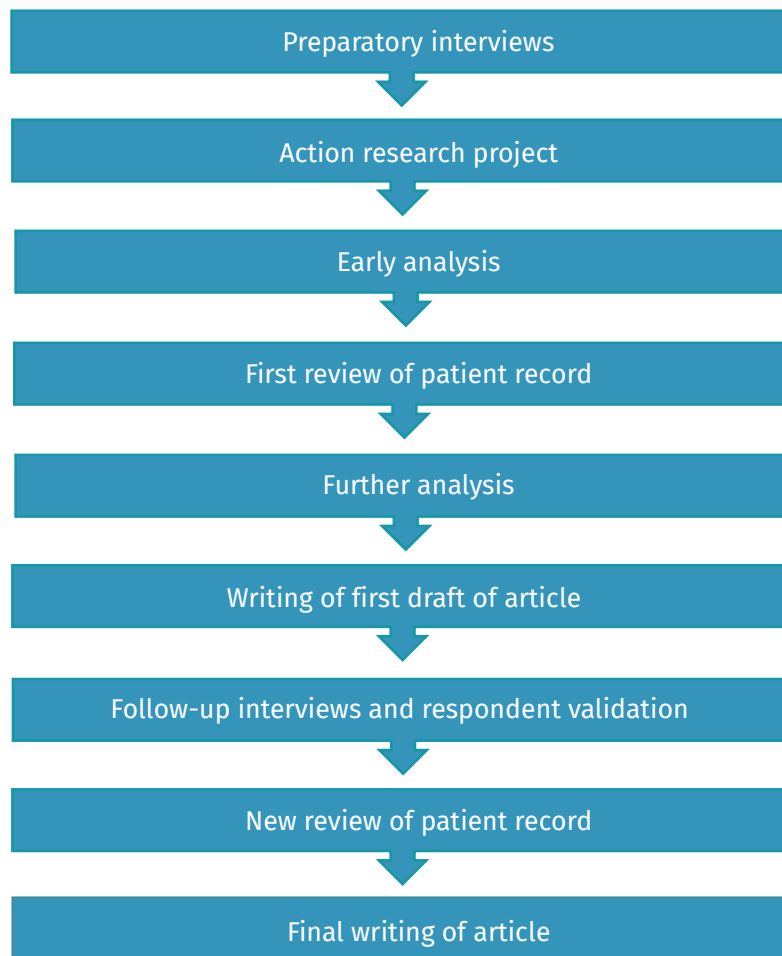
Figure 2. The Research Process.