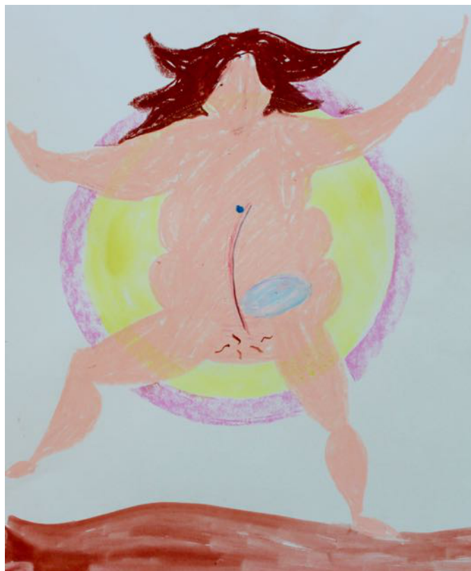
Figure 3. Client picture after treatment

MW: I'm stuck. Encapsulated in an egg. Have to stand it. Have to become better. Aching, feel ungangly. Without identity. Branded.