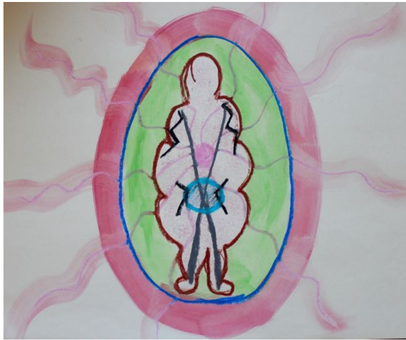
Figure 2. Client picture before treatment

AG: They strapped me. They made me mushy.