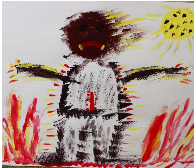
Figure 4. Client picture before treatment

AG: They have cut me in pieces. The soil is burning, and even the sun is blackened. I am standing in the middle of this.