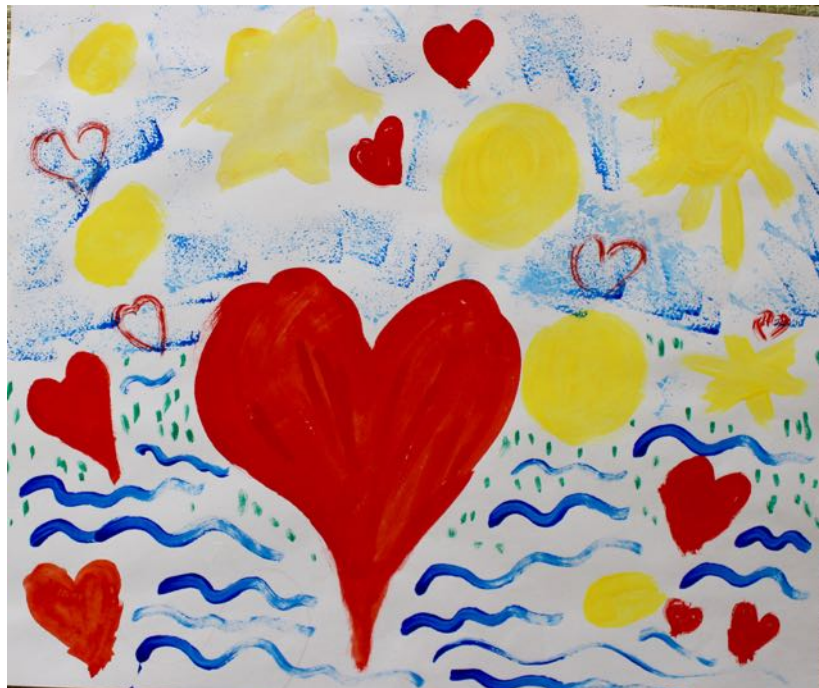
Figure 5. Client picture after treatment

MW: I am angry! Enraged at life! And scared! It is the solar eclipse. The day of wrath. I must fight!