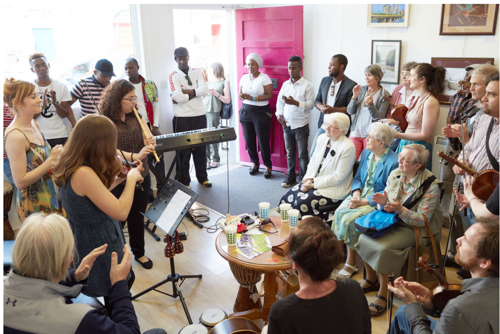
Figure 3. Irish World Music Café