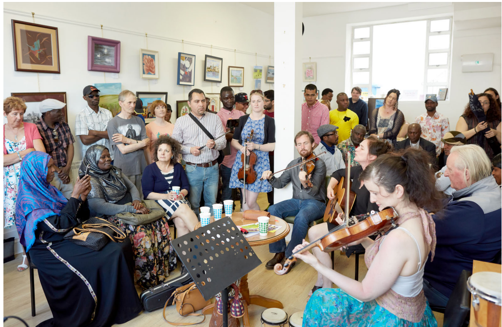
Figure 2. Irish World Music Café