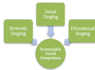
Figure 1. A Model of Singing for Sustainable Social Integration