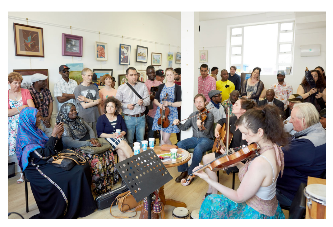
Figure 2. Irish World Music Café