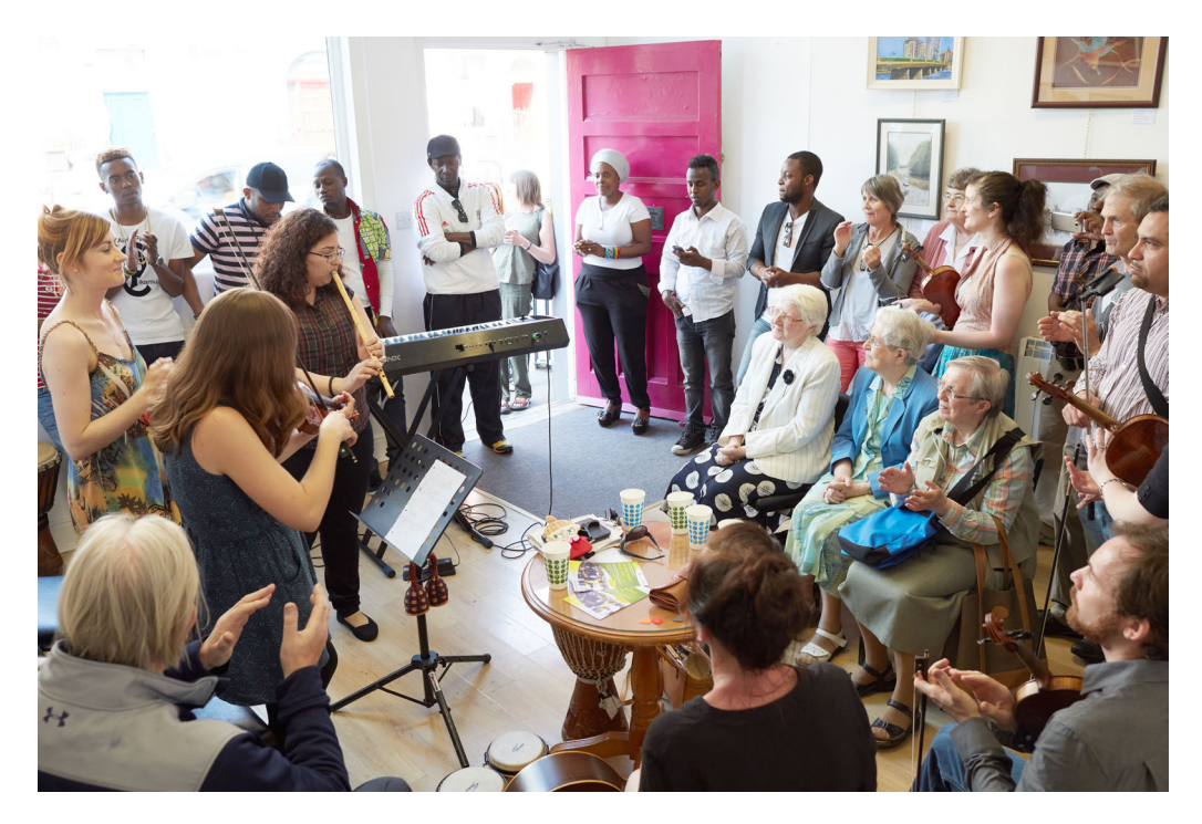
Figure 3. Irish World Music Café